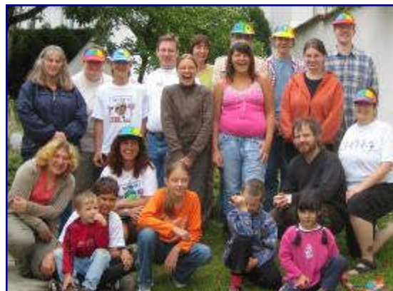
The team poses with some of the VBS participants from Blansko. We enjoyed a week of Bible lessons, crafts, games, music and reflection time based on the Cokesbury VBS curriculum, "Lift Off! Soaring to New Heights with God."