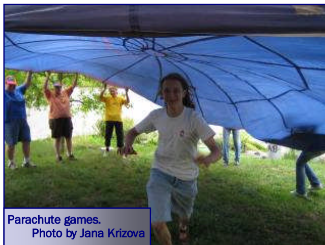
Parachute games.

After a spirited session in the back yard with the water pistols we had brought, we ended VBS with a pizza party for the kids, each of them getting a whole pizza to enjoy. As we gathered our things to leave for the train station, there was a flurry of last-minute picture taking and signing of t-shirts. It was hard to say goodbye.