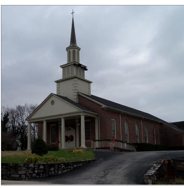
DANDRIDGE FIRST UMC - Dandridge, Tennessee

Through the years many seeds have been planted and have grown into a great harvest. Today Dandridge First United Methodist Church is approaching $100,000 in endowments and more are on the way. They adopted the draft endowment charter supplied by the Foundation for their