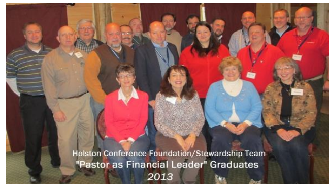
Holston Conference Foundation/Stewardship Team "Pastor as Financial Leader" Graduates 2013