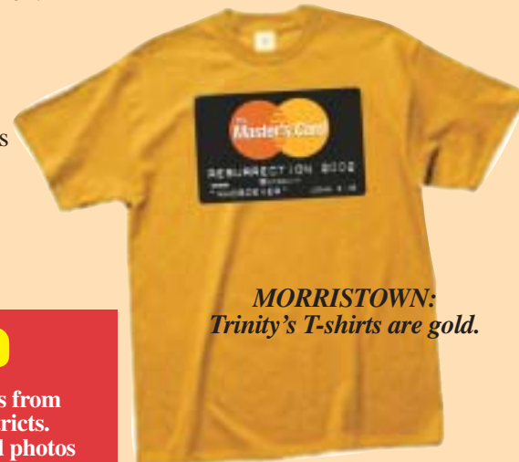
MORRISTOWN: Trinity's T-shirts are gold.