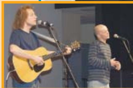
▲ KNOXVILLE: Lost & Found performs at Cokesbury UMC.