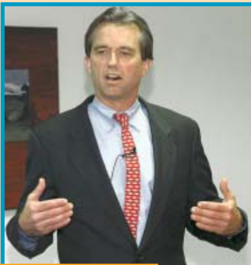
▲ ABINGDON: Robert Kennedy Jr. speaks at Emory & Henry College.