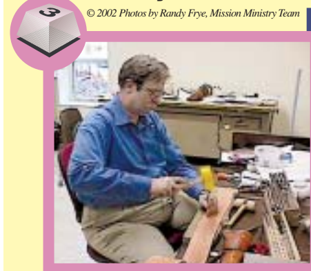
■ Jubilee Project