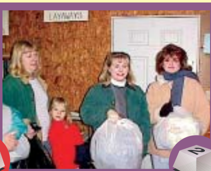
■ Morgan-Scott Project