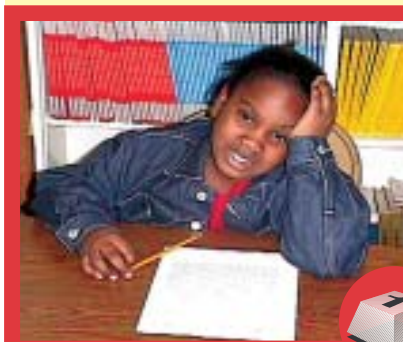
■ Wesley House

SPRING MISSION PROJECT WILL BENEFIT SEVEN LOCAL AGENCIES