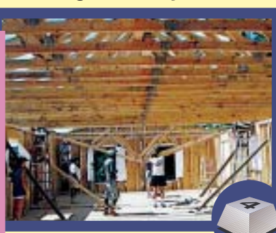
■ Project Crossroads