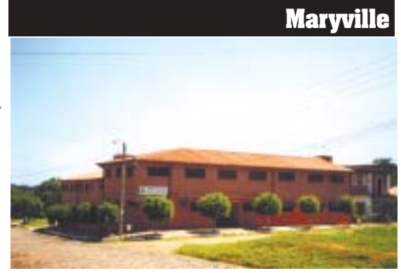
Maryville Middlesettlements gives $54,700 to help build Nuevo Horizonte, a school in Paraguay (above).