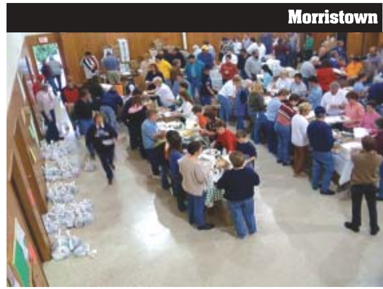
Morristown Hundreds of church and community volunteers pack up Thanksgiving feasts for the needy in Greene County.