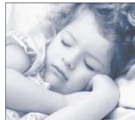
United Methodist TV commercials featuring a sleeping child are showing nationally this month.