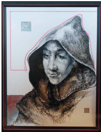
"The Monk" by Moe Mitchell

Check out the First-Centenary UMC Facebook page and www.firstcentenary.com for behind-the-scenes content and interviews with featured artists!